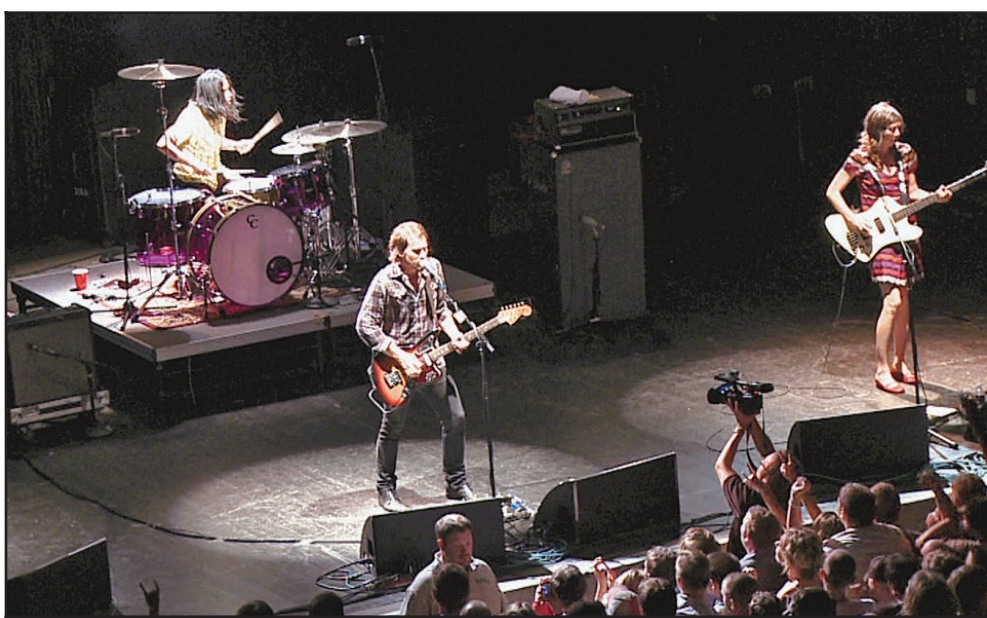
The band Silversun Pickups, performing at the Lifestyle Communities Pavilion, is featured on PromoWest Live , a new TV program created by PromoWest Productions.